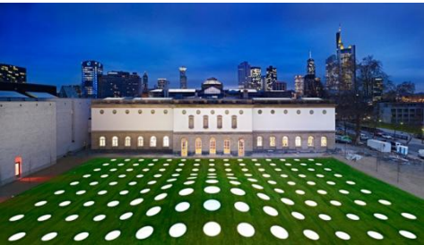
Stadel Museum, Frankfurt am Main, Germany