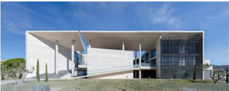
Building of the municipal water company in Lamia.