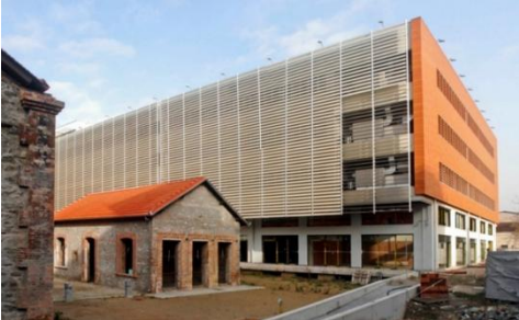
Building of Central Macedonia Region headquarters.