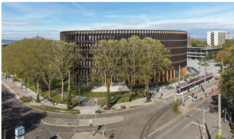
Townhall, Freiburg, Germany